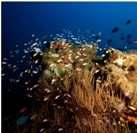
ACTIVE MARINE LIFE