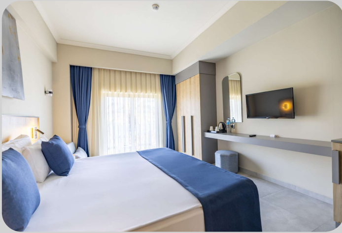
Club Standard Land View