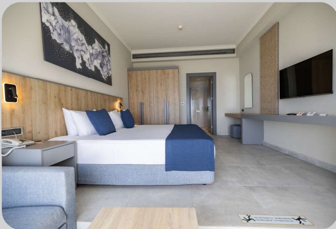
Main Building Standard Land View